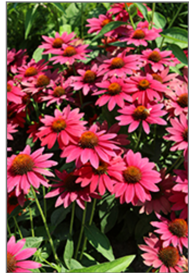
Sombrero Tres Amigos Coneflower flowers

This is a relatively low maintenance plant, and is best cleaned up in early spring before it resumes active growth for the season. It is a good choice for attracting butterflies to your yard, but is not particularly attractive to deer who tend to leave it alone in favor of tastier treats. It has no significant negative characteristics.