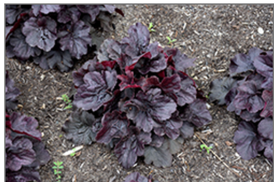
Northern Exposure Black Coral Bells