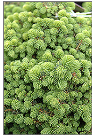
Little Gem Spruce foliage