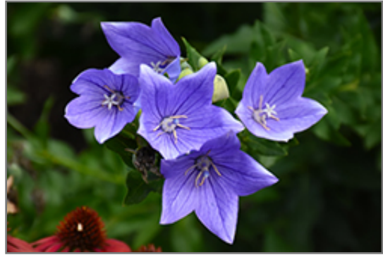
Marie's Balloon Flower flowers