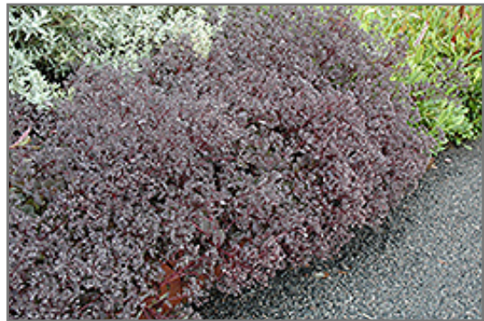
Bertram Anderson Stonecrop