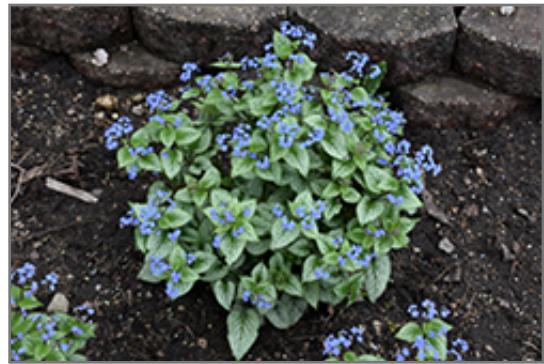
Sterling Silver Bugloss in bloom