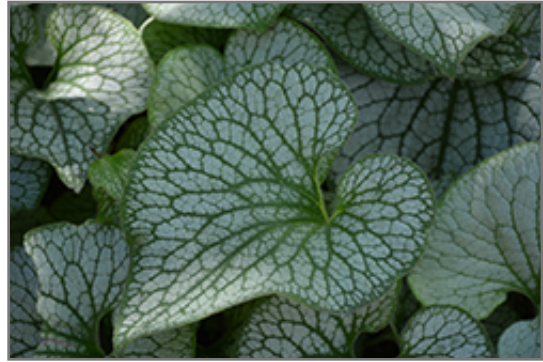
Sterling Silver Bugloss foliage

Sterling Silver Bugloss will grow to be about 12 inches tall at maturity, with a spread of 24 inches. When grown in masses or used as a bedding plant, individual plants should be spaced approximately 20 inches apart. It grows at a medium rate, and under ideal conditions can be expected to live for approximately 10 years. As an herbaceous perennial, this plant will usually die back to the crown each winter, and will regrow from the base each spring. Be careful not to disturb the crown in late winter when it may not be readily seen!