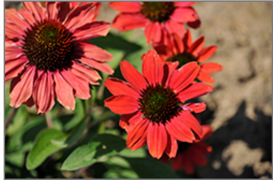
Color Coded Frankly Scarlet Coneflower flowers

Color Coded Frankly Scarlet Coneflower will grow to be about 24 inches tall at maturity, with a spread of 20 inches. When grown in masses or used as a bedding plant, individual plants should be spaced approximately 16 inches apart. Its foliage tends to remain dense right to the ground, not requiring facer plants in front. It grows at a medium rate, and under ideal conditions can be expected to live for approximately 10 years. As an herbaceous perennial, this plant will usually die back to the crown each winter, and will regrow from the base each spring. Be careful not to disturb the crown in late winter when it may not be readily seen!