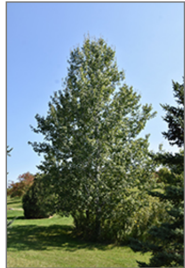
Quaking Aspen

Quaking Aspen is recommended for the following landscape applications;