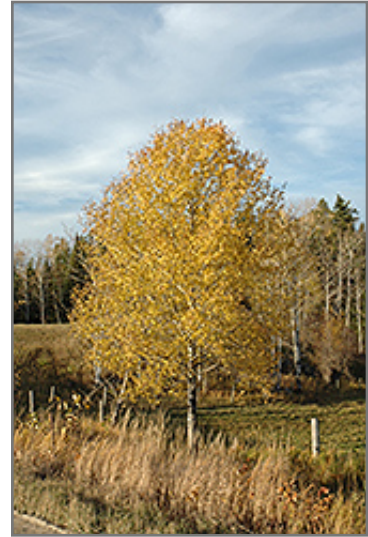
Quaking Aspen in fall

5' $49.99 / 6' $81.99 / 8' $134.99 / 1.5" $199.99 / 1.75" $239.99 / 2" $269.99 / CLUMP- 8' $189.99