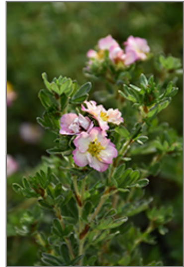
Happy Face Hearts Potentilla flowers