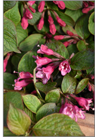
Midnight Sun Reblooming Weigela flowers