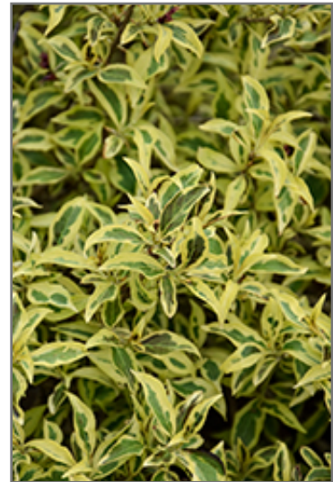
Bubbly Wine Weigela foliage

Bubbly Wine Weigela is recommended for the following landscape applications;