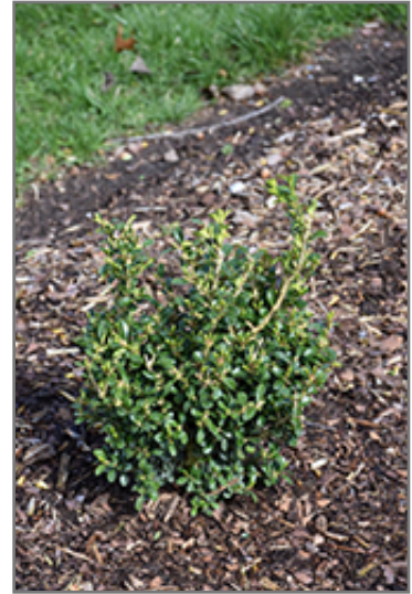
NewGen Independence Boxwood