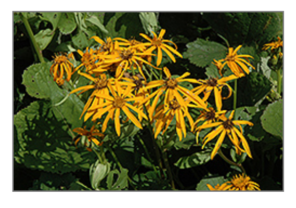
Othello Golden-ray flowers