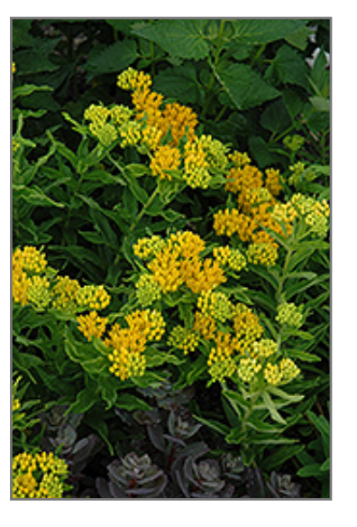
Hello Yellow Butterfly Flower flowers