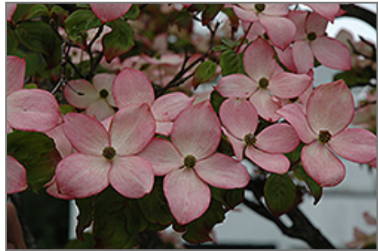
Satomi Chinese Dogwood flowers

Satomi Chinese Dogwood is recommended for the following landscape applications;