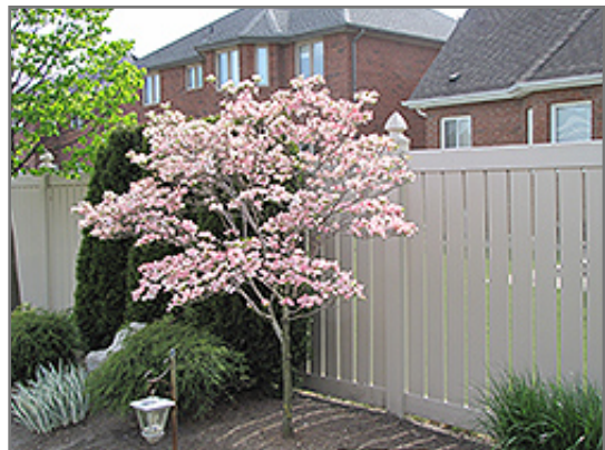
Satomi Chinese Dogwood in bloom