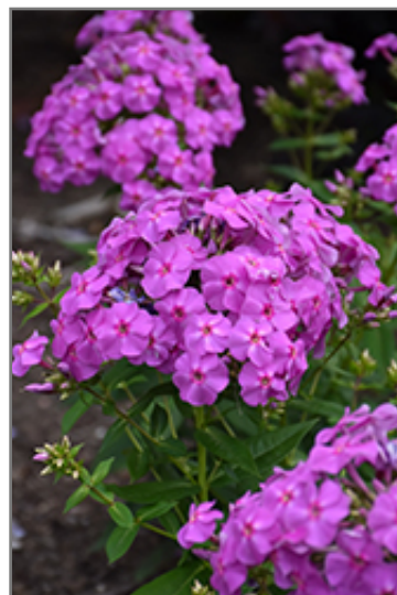
Lilac Flame Garden Phlox flowers

Lilac Flame Garden Phlox is recommended for the following landscape applications;