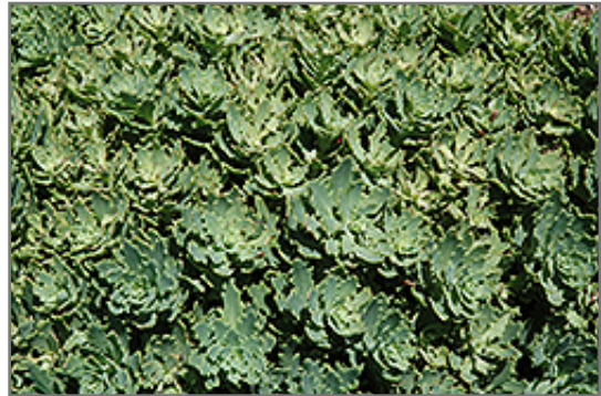
Thundercloud Stonecrop