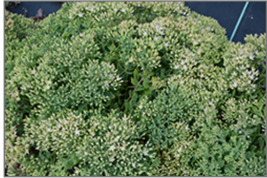
Thundercloud Stonecrop flower buds