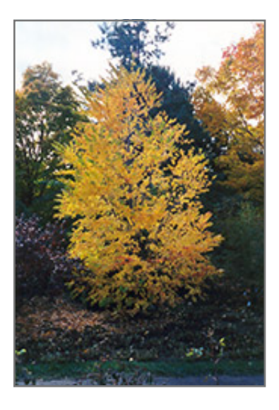
Katsura Tree in fall