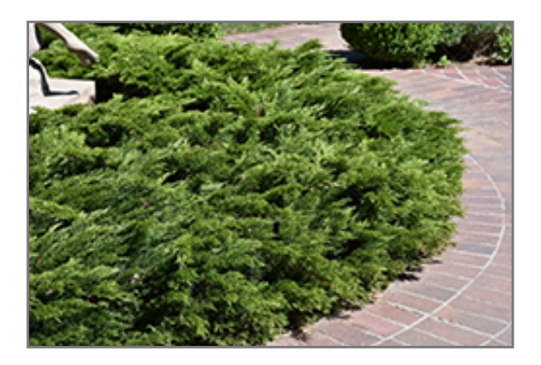
Calgary Carpet Juniper