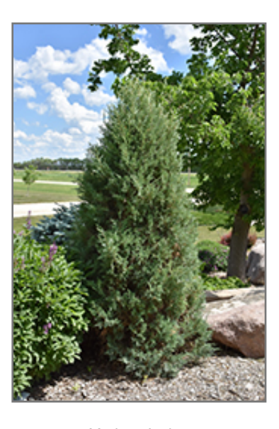
Medora Juniper