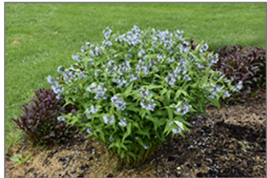
Willow Bluestar in bloom