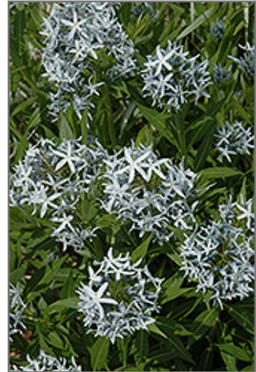
Willow Bluestar flowers