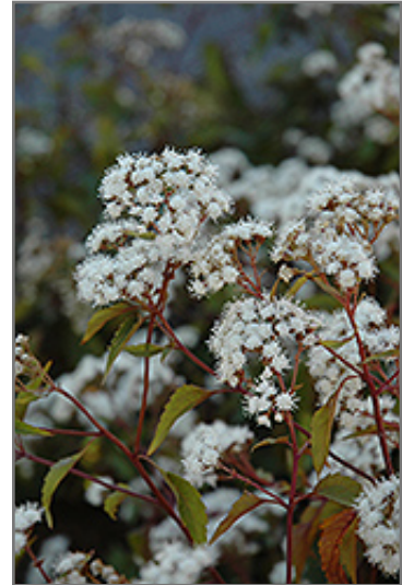
Chocolate Snakeroot flowers