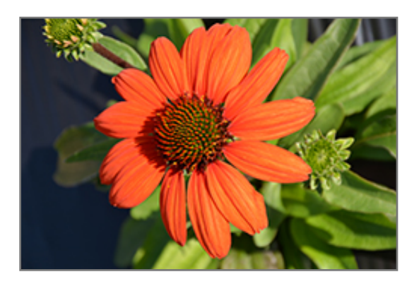
Kismet Intense Orange Coneflower flowers

7777 N. 76th Street Milwaukee, WI 53223 Phone: 414.354.4830 800. 236.4830