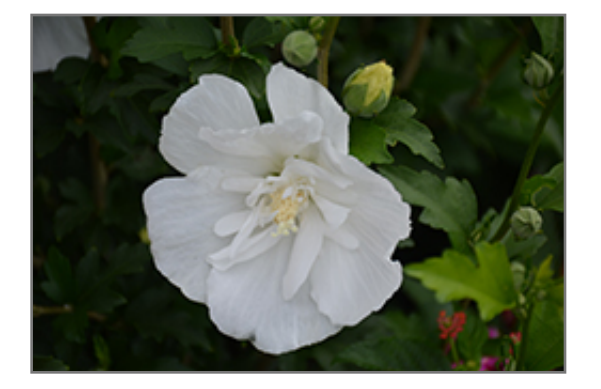
White Pillar Rose of Sharon flowers