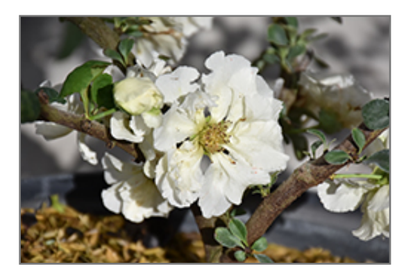
Double Take Eternal White Flowering Quince flowers

7777 N. 76th Street Milwaukee, WI 53223 Phone: 414.354.4830 800. 236.4830