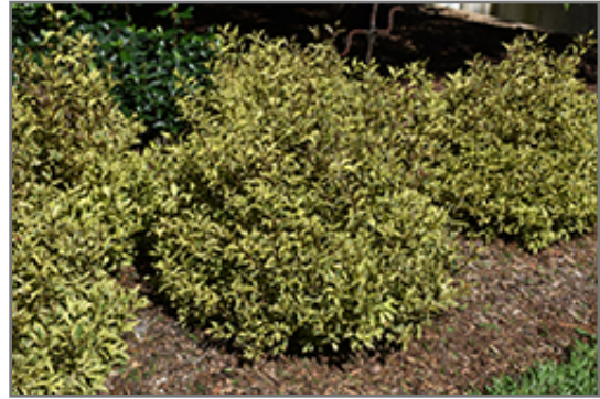
Bubbly Wine Weigela

Bubbly Wine Weigela will grow to be about 3 feet tall at maturity, with a spread of 3 feet. It tends to fill out right to the ground and therefore doesn't necessarily require facer plants in front. It grows at a medium rate, and under ideal conditions can be expected to live for approximately 30 years.