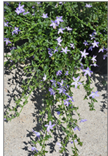
Blue Waterfall Bellflower in bloom