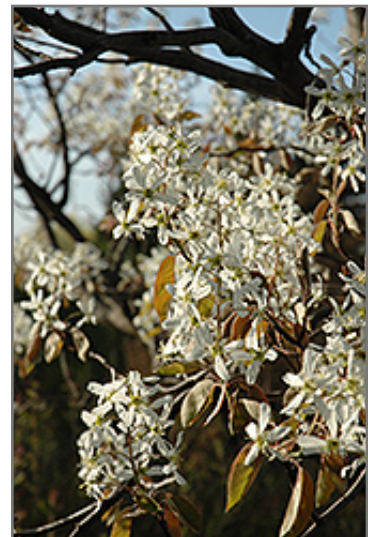
Cumulus Serviceberry flowers