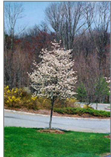
Cumulus Serviceberry in bloom