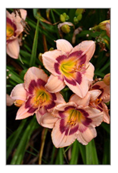
Wineberry Candy Daylily flowers