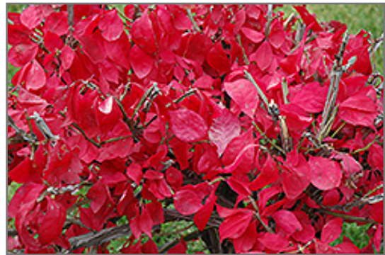
Dwarf Burning Bush in fall