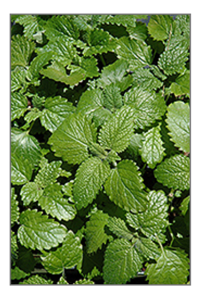
Lemon Balm foliage

Lemon Balm's attractive fragrant pointy leaves emerge light green in spring, turning green in color throughout the season on a plant with an upright spreading habit of growth. It features dainty lightly-scented white flowers along the stems in late summer.