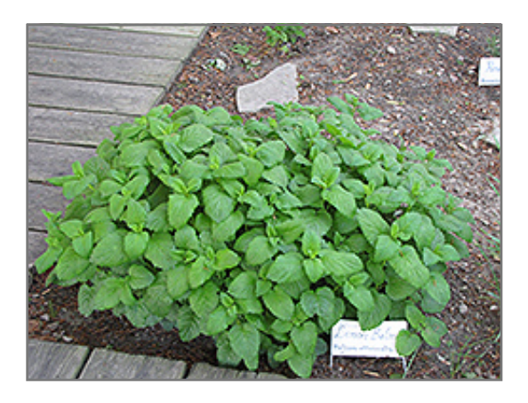
Lemon Balm