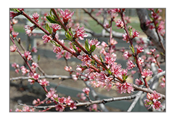
Redhaven Peach flowers