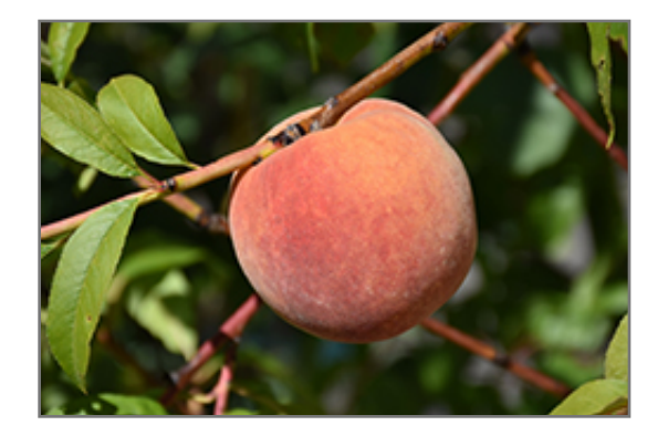
Redhaven Peach fruit

Redhaven Peach is covered in stunning clusters of fragrant pink flowers along the branches in early spring, which emerge from distinctive rose flower buds before the leaves. It has dark green deciduous foliage. The narrow leaves turn yellow in fall. The fruits are showy yellow drupes with a red blush, which are carried in abundance in mid summer. The fruit can be messy if allowed to drop on the lawn or walkways, and may require occasional clean-up.