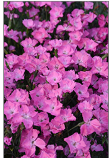
Kahori Pinks flowers

Kahori Pinks is recommended for the following landscape applications;