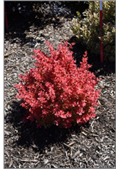
Sunjoy Neo Japanese Barberry