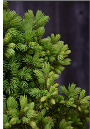
Rainbow's End Spruce foliage