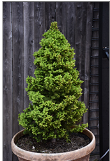
Rainbow's End Spruce