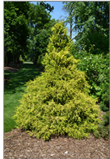
Golden Mop Falsecypress

Golden Mop Falsecypress is recommended for the following landscape applications;