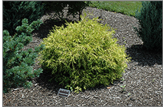
Golden Mop Falsecypress