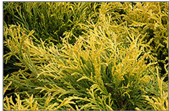
Golden Mop Falsecypress foliage