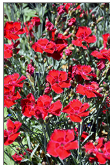
Star Single Fire Star Pinks flowers