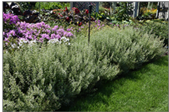
Montrose White Catmint in bloom