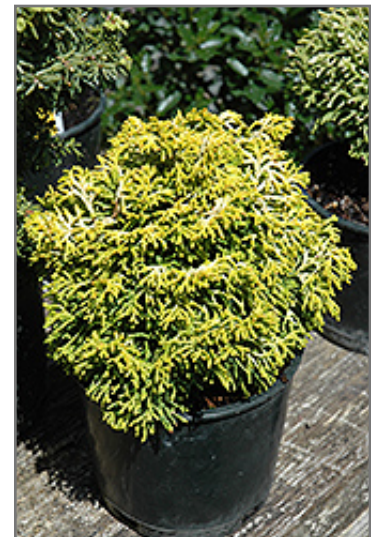
Butter Ball Hinoki Falsecypress