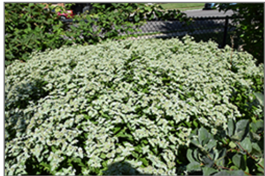
Smooth Mountain Mint in bloom