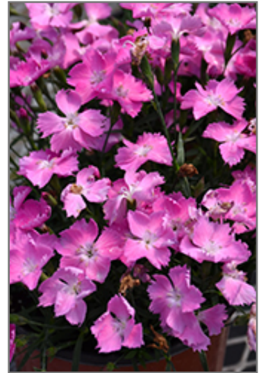
Kahori Pinks flowers