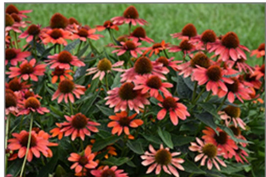
Sombrero Flamenco Orange Coneflower flowers