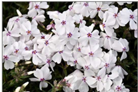
Amazing Grace Creeping Phlox flowers