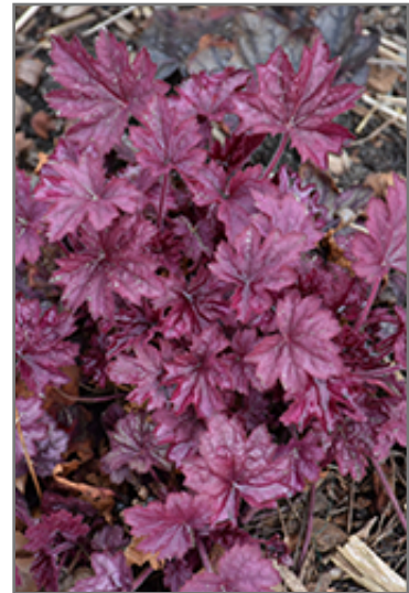
Primo Wild Rose Coral Bells foliage