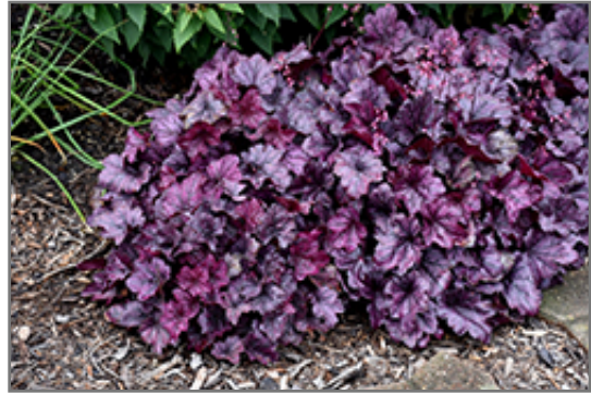
Primo Wild Rose Coral Bells

Primo Wild Rose Coral Bells is a dense herbaceous evergreen perennial with tall flower stalks held atop a low mound of foliage. Its relatively coarse texture can be used to stand it apart from other garden plants with finer foliage.