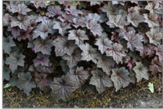
Palace Purple Coral Bells

4.5" CONT $6.99 / #1 CONT $13.99 / 8" CONT $15.99