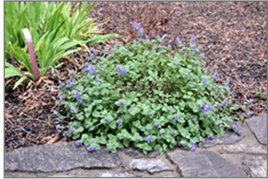
Early Bird Catmint in bloom

Early Bird Catmint will grow to be about 10 inches tall at maturity, with a spread of 12 inches. When grown in masses or used as a bedding plant, individual plants should be spaced approximately 10 inches apart. Its foliage tends to remain low and dense right to the ground. It grows at a fast rate, and under ideal conditions can be expected to live for approximately 10 years. As an herbaceous perennial, this plant will usually die back to the crown each winter, and will regrow from the base each spring. Be careful not to disturb the crown in late winter when it may not be readily seen!