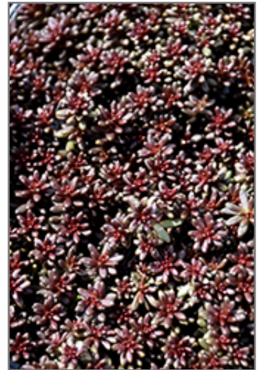
Coral Carpet Stonecrop

Coral Carpet Stonecrop is recommended for the following landscape applications;