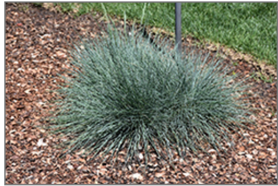
Cool As Ice Blue Fescue

Cool As Ice Blue Fescue is recommended for the following landscape applications;