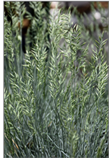
Cool As Ice Blue Fescue flowers