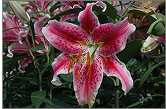
Stargazer Oriental Lily flowers