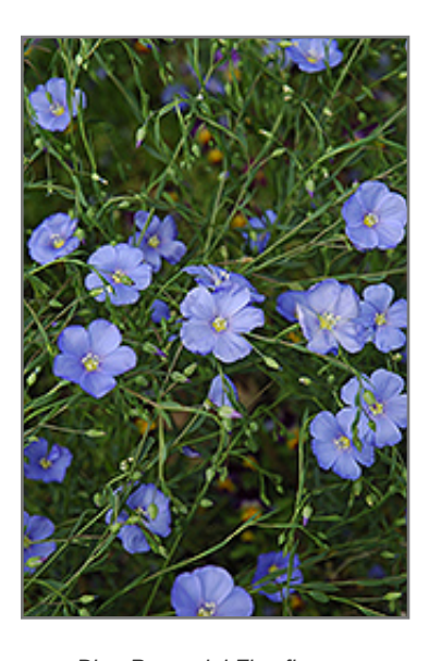
Blue Perennial Flax flowers

Blue Perennial Flax will grow to be about 24 inches tall at maturity, with a spread of 12 inches. When grown in masses or used as a bedding plant, individual plants should be spaced approximately 8 inches apart. It tends to be leggy, with a typical clearance of 1 foot from the ground, and should be underplanted with lower-growing perennials. It grows at a fast rate, and under ideal conditions can be expected to live for approximately 3 years. As an herbaceous perennial, this plant will usually die back to the crown each winter, and will regrow from the base each spring. Be careful not to disturb the crown in late winter when it may not be readily seen!